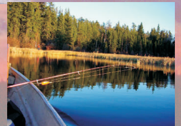
Dangle a Hook