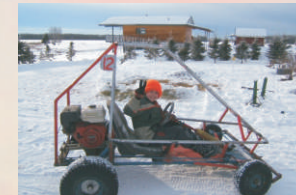
Karting in February At River Trail