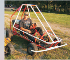
River Trail's Go-Kart